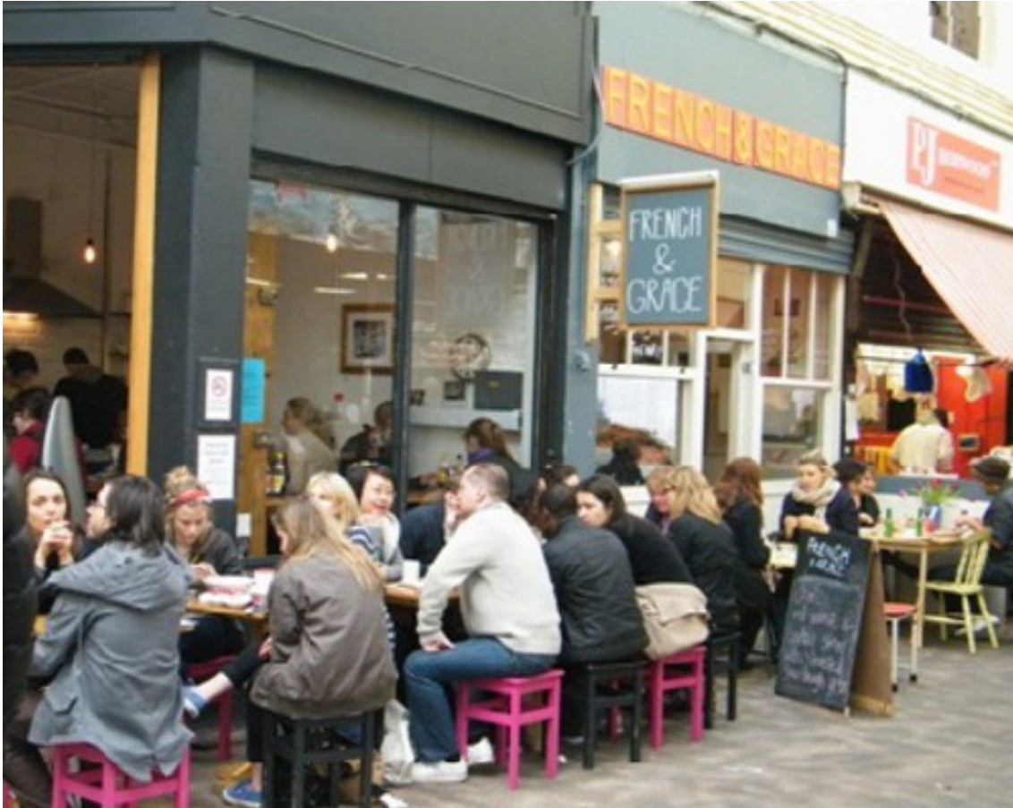
Brixton Village is home to numerous restaurants and shops aimed at the area’s gentrified population. © Amélie Bertholet, April 2012.

Today, there are still many examples of socio-spatial segregation in Brixton. For instance, cheap and cheerful shops primarily serving the Jamaican community, which sometimes close because of rising rents for commercial premises and the effects of the financial crisis, now find themselves cheek by jowl with chic boutiques and relatively expensive franchises, although these are still in a minority; the Underground seems to be the preserve of an elite (Figure 2), while the poorest take the bus, as it is cheaper; and a strict compartmentalisation of housing stock reinforces micro-local differences: upmarket streets stand out more and more from the large social-housing estates on the edges of Brixton, which are often in a poor state of repair. Sometimes, differences are apparent at even finer levels, e.g. within the same staircase.