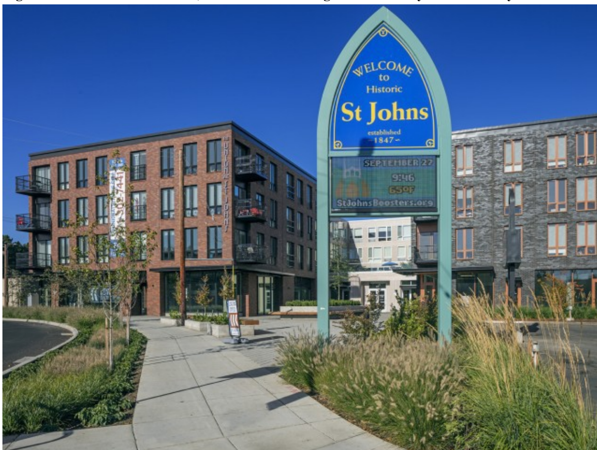
Figure 3. The Union at St Johns, with the welcome sign that formerly resided on Ivy Island

The project was completed in early 2018, and the street was reopened after nearly two years of closure. This image shows the rear plaza, with the site of Ivy Island just out of frame left. Studio apartments for rent start at $1,250 (C&R Real Estate 2018).