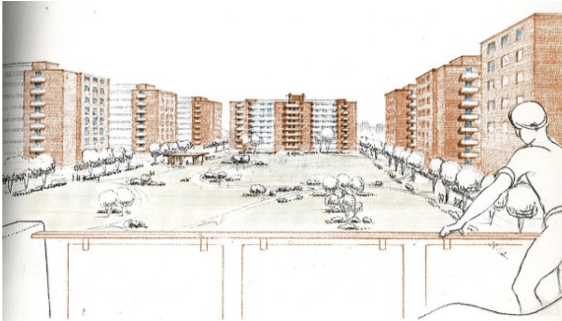
Figure 1. A sketch of the project